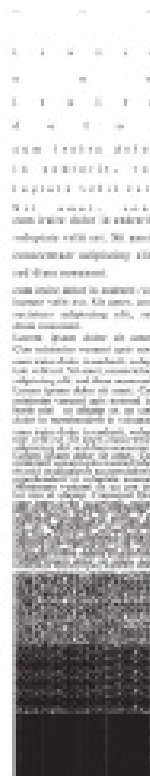
This is an example of how typography can be used to create a value scale.

*This is just an example, you are not required to use typography*