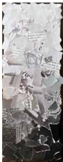
This is an example of a successful assignment